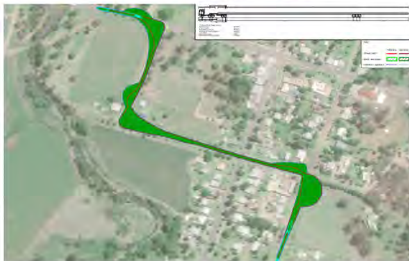
Figure 3.45: Wind Blades Swept Paths Alternative Route South (Part1)